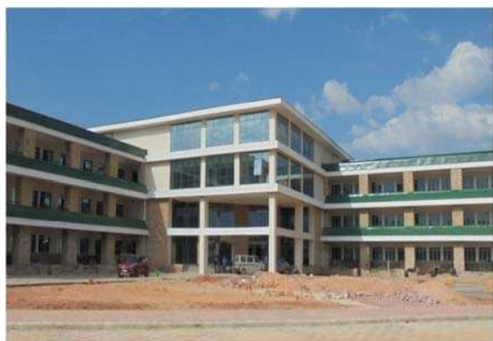
Academic Block IIM Shillong, Meghalaya