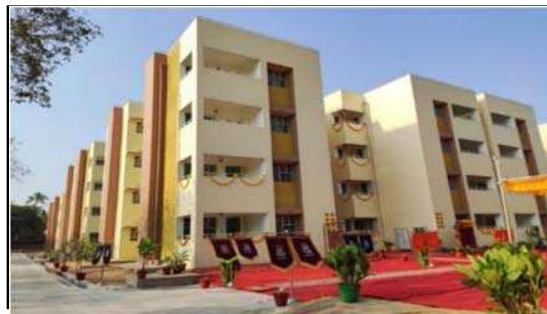
77 Nos. Type-II Family Quarters GC CRPF Chandrayanguta, Hyderabad