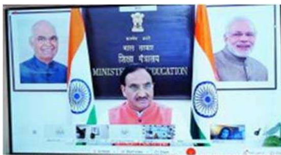
Shri Ramesh Pokhriyal 'Nishank', Hon'ble Minister of Education, virtually inaugurated Phase 1A buildings of National Institute of Technology Andhra Pradesh at Tadepalligudem, Andhra Pradesh on October 27, 2020