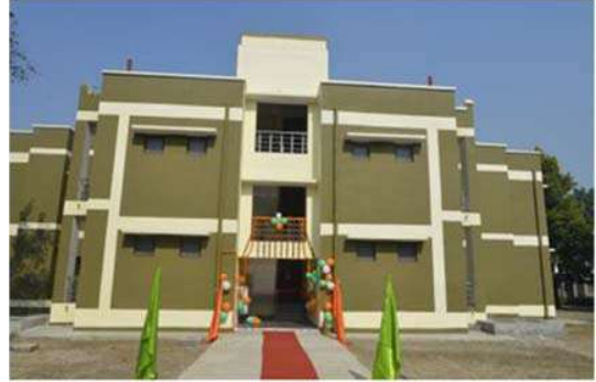
Type-IV Residential Qtrs. CRPF, Group Centre Phaphamau, Allahabad