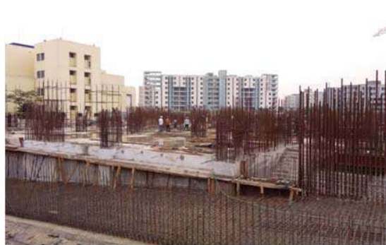
Academic Block and Administrative Block for AIIMS, Raipur