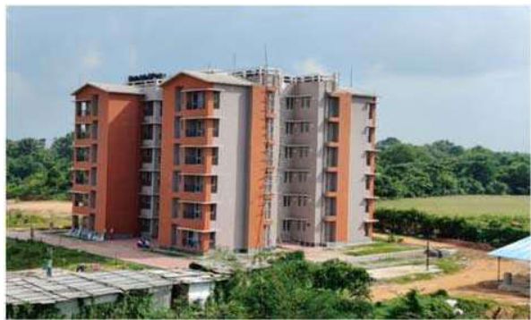
Staff Quarters for Tripura University, Agartala