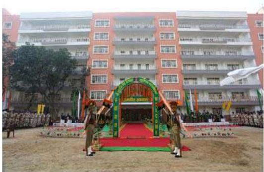
720 Men Barrack ITBP Tigri, New Delhi