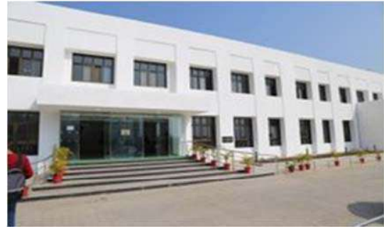
Dining Hall and Food Court Building, IIT Indore