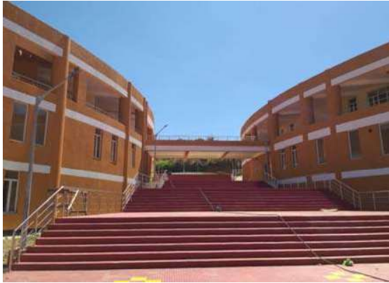
Regional Centre of IIMC Complex at Aizawl (Mizoram)