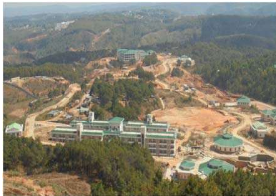
IIM Shillong, Meghalaya