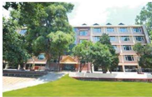
Administrative and Training Block SSB, TTC, Kasumpti, Shimla (H.P.)