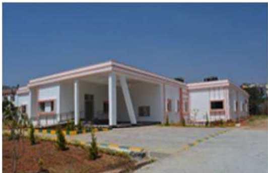
Climate Chamber and Animal House facilities, National Institute of Animal Nutrition and Physiology, Bangalore