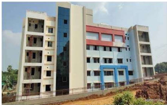
Agartala Government Medical College, Tripura