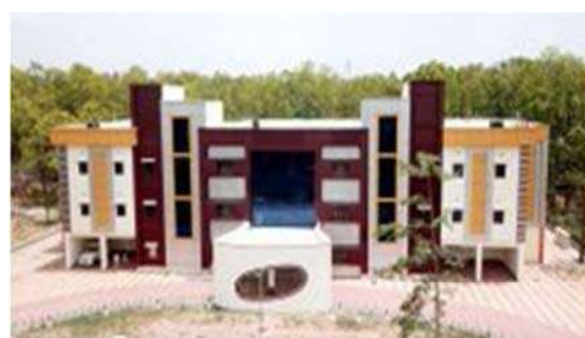
TAC & support weapon group building, BSF, MeruHazaribagh