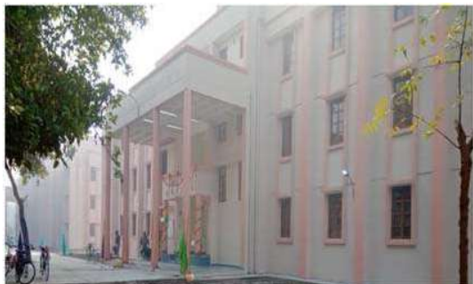
Barrack Building constructed by CPWD at CRPF Group Centre Prayagraj Allahabad