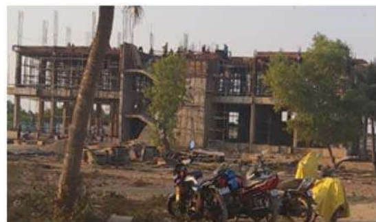
Permanent Campus of IISER Project, at- Berhampur, Odisha