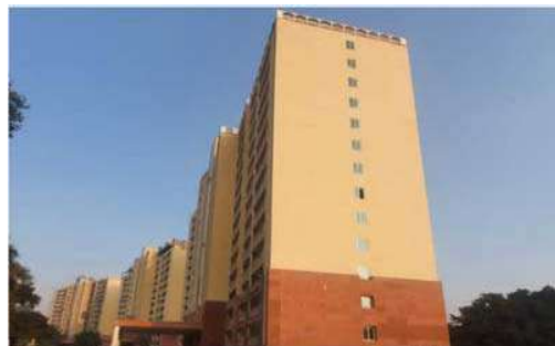
76 flats for Hon'ble MPs at Dr. BD Marg, New Delhi