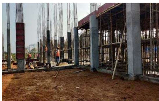
School of Engineering Sciences & Technology block at Hyderabad Central University