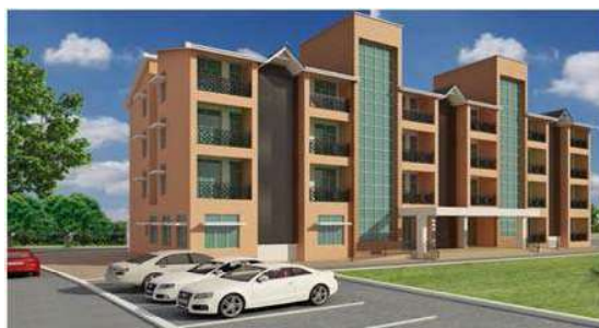
Proposed Holiday Home at Thiruvananthapuram