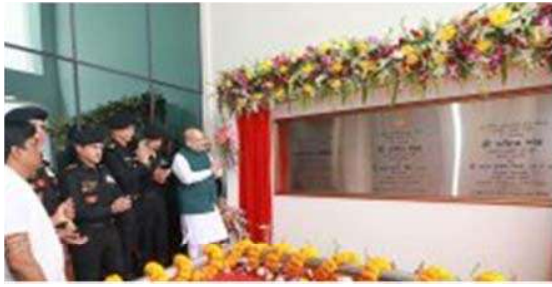
Shri Amit Shah, Hon'ble Home Minister inaugurated the Regional Hub for NSG at Rajarhat, Kolkata on March, 01, 2020.