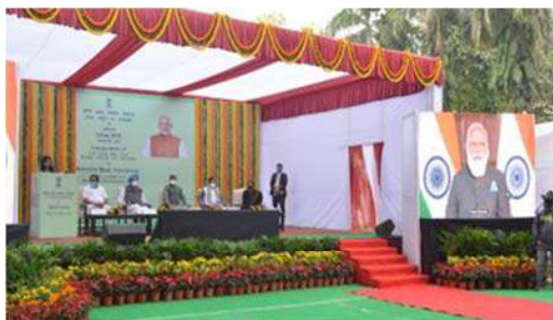
Hon'ble Prime Minister of India inaugurated 76 flats for Hon'ble MPs on November 23, 2020 at Dr. BD Marg, New Delhi

15.41 Some of the major works completed and inaugurated by the VVIPs are as under: