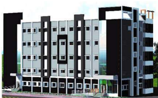
Proposed building for Animal House at JIPMER Campus at Puducherry