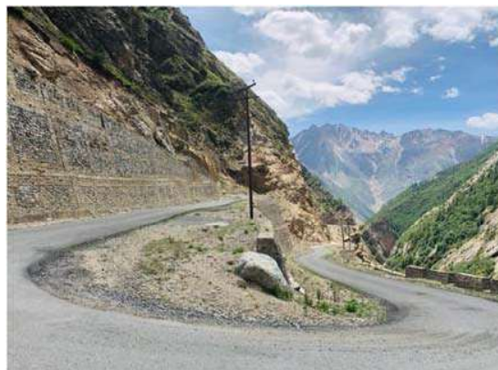
Site photos of NitiGeldung ICBR Road