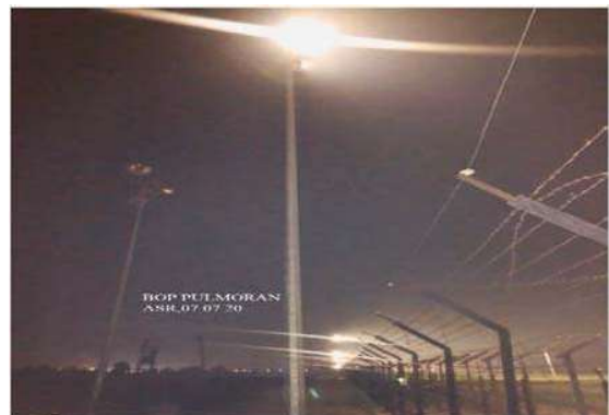
Replacement of Border Flood Lighting infrastructure along Indo-Pak Border under Punjab Frontier (in progress)