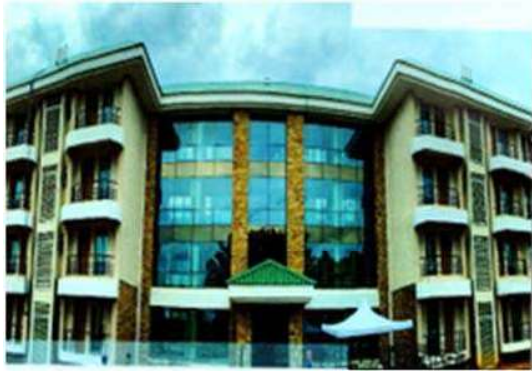
Corona Care and Quarantine Facility Centre, IIM Campus, Shillong