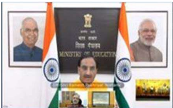
Shri Ramesh Pokhriyal 'Nishank', Hon'ble Minister of Human Resource Development virtually inaugurated 'Diamond Jubilee Lecture Hall Complex' at NIT Jamshedpur on October 20, 2020