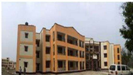
180 Men Barrack for CRPE, Jhaphan Muzaffarpur, Bihar