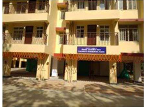
200 Teacher's flats at Banaras Hindu University, Varanasi