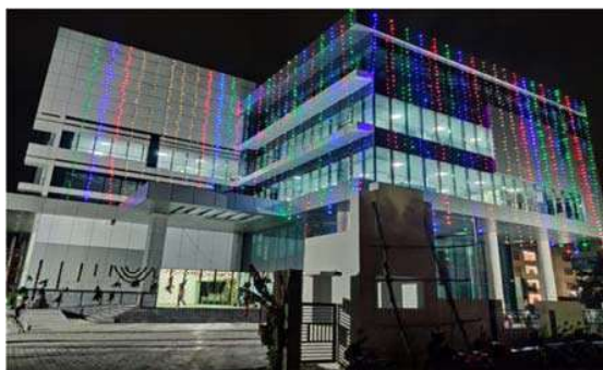
Office building of Dredging Corporation of India, Visakhapatnam, Andhra Pradesh