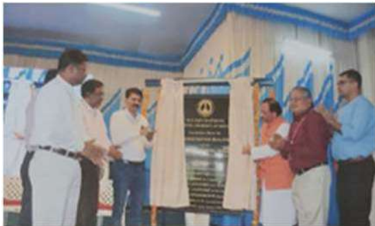
Shri Ramesh Pokhriyal "NISHANK", Hon'ble Minister for Human Resource Department inaugurated 'Building for School of Education (SARASWATHI)' Central University Kerala at Periya, Kasargod on February 25, 2020