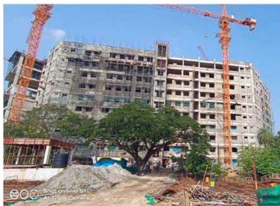
Boys Hostel at IITM, Chennai