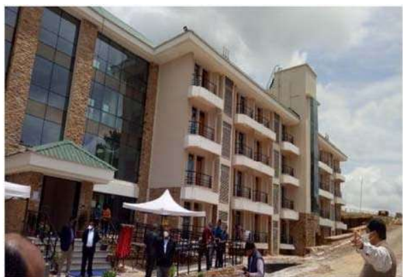
Hostel Block IIM Shillong, Meghalaya