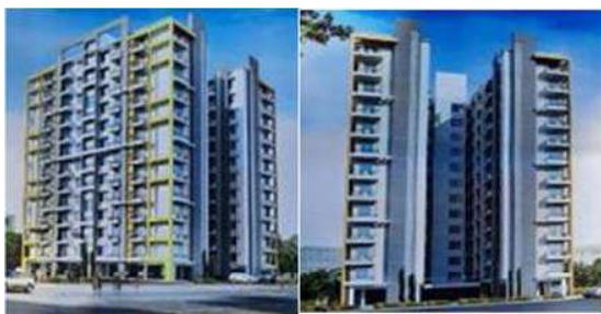
Proposed 48 multi storied Faculty Quarters at Motilal Nehru National Institute of Technology Allahabad