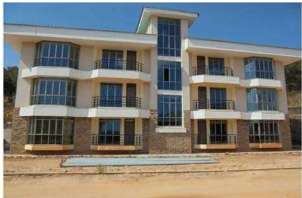
Residential Quarters, IIM, Shillong, Meghalaya