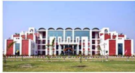
Regional Hub for NSG at Rajarhat, Kolkata