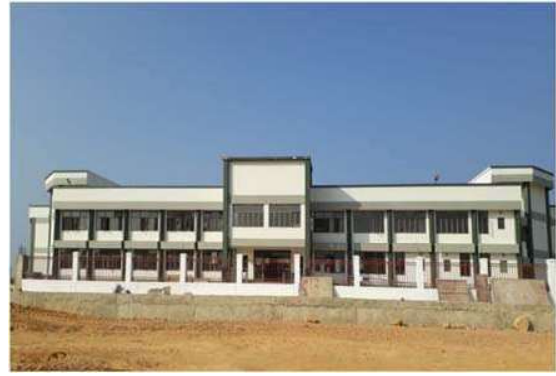
School Building Kendriya Vidyalaya, Silchar