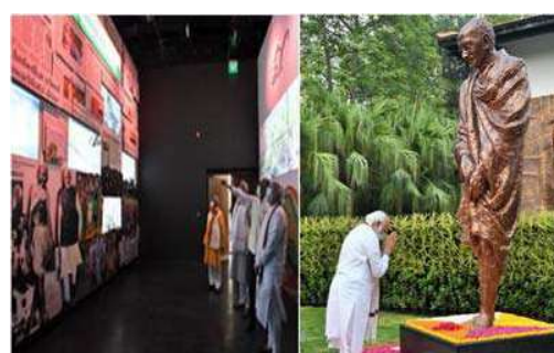
'Rashtriya Swachhta Kendra' at Gandhi Darshan, Rajghat, New Delhi