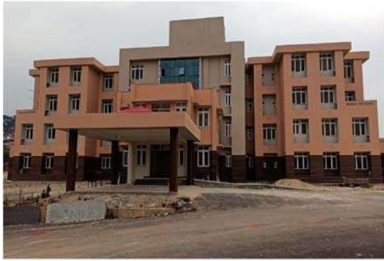
Geological Survey of India, Shillong