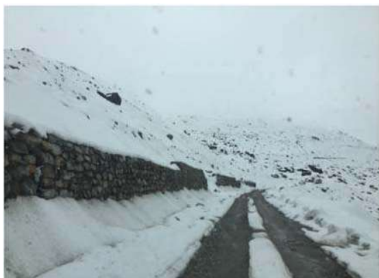
Thangu to Muguthang ICBR Road in Progress