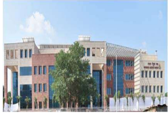
Shram Bureau Bhawan, Chandigarh