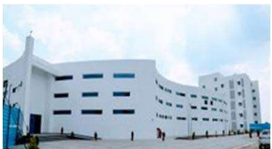
Vikramshila Seminar Hall, IIT Indore