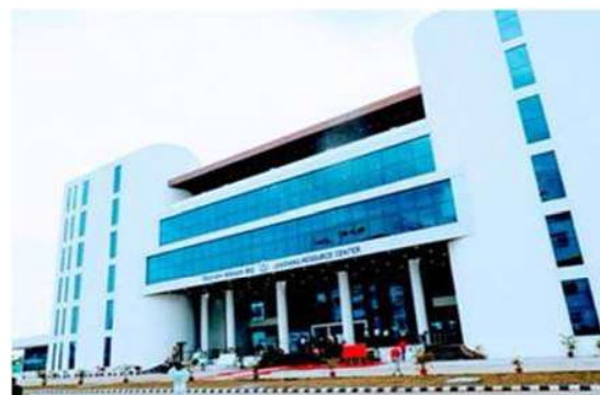
Learning Resource Center, IIT Indore