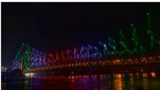
State-of-the-Art Dynamic Architectural Illumination with synchronized light & sound system of RabindraSetu (Howrah Bridge) Kolkata