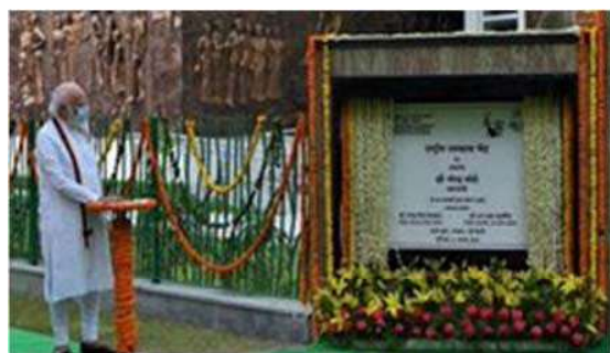
Hon'ble Prime Minister of India inaugurated 'Rashtriya Swachhta Kendra' at Gandhi Darshan, Rajghat, New Delhi on August 08, 2020.