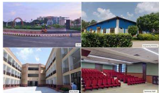
Boys Hostel, Wi-Fi Park, Seminar Hall and Engineering Workshop at Central University of Haryana, Mahendragarh