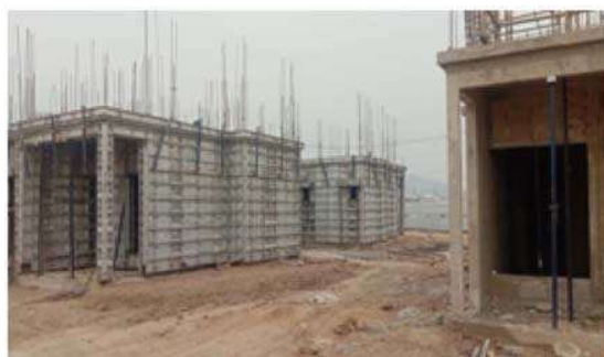
683 Residential quarters at GC, CRPF, Chandauli