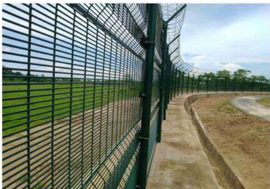
Modular (Smart) Fencing in Assam on IBB