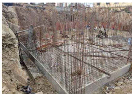
CGST Office Building, Udaipur, Rajasthan