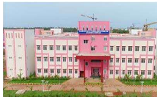
National Institute of Technology Andhra Pradesh