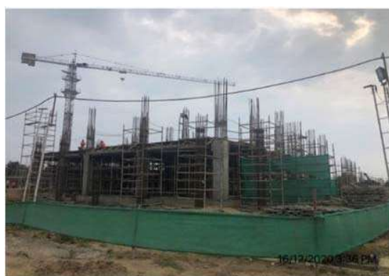
Construction of Permanent Campus for Indian Institute of Technology Palakkad Phase- I (A)