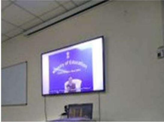
Dr. Ramesh Pokhriyal 'Nishank', Hon'ble Minister of Education virtually inaugurated 200 Teacher's flats constructed by CPWD at Banaras Hindu University, Varanasi on August 27, 2020