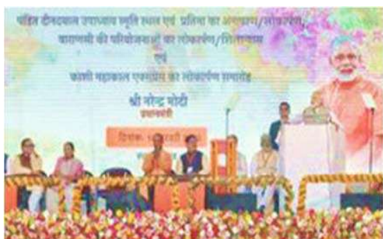
Hon'ble Prime Minister of India, besides many other projects inaugurated six State of the Art Iconic projects completed by CPWD at Varanasi during a function held at Varanasi on February 16, 2020.