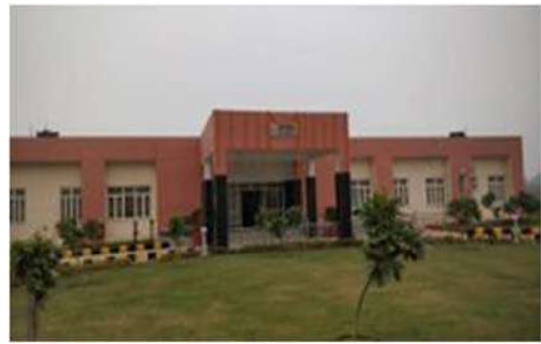
Excellent Multi Purpose Security Infrastructure for ITBP at Prayagraj, UP