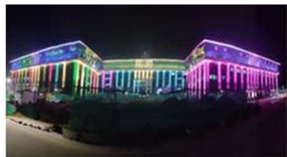
State-of-the-Art Dynamic Façade Lighting of Itanagar Secretariat Building on the occasion of Arunachal Day