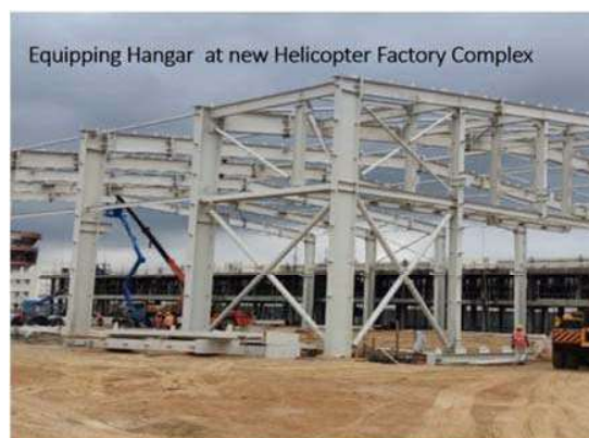
New Helicopter Manufacturing Factory in Gubbi Taluk, Tumakuru District (Karnataka)