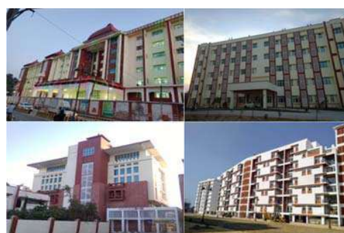
Centenary 430 bedded Super Speciality Hospital, 74 Bedded Psychiatric Hospital, Vedic Vigyan Kendra, Bharat Adhyayan Kendra, 99 Residential flats for Tata Memorial Trust and Rejuvenated Mandakini Kund, at Varanasi