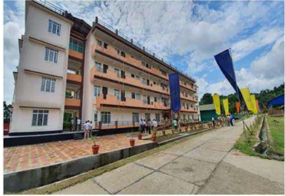
120 men barrack for 10 th bn. ITBP at Kimin (Arunachal Pradesh)