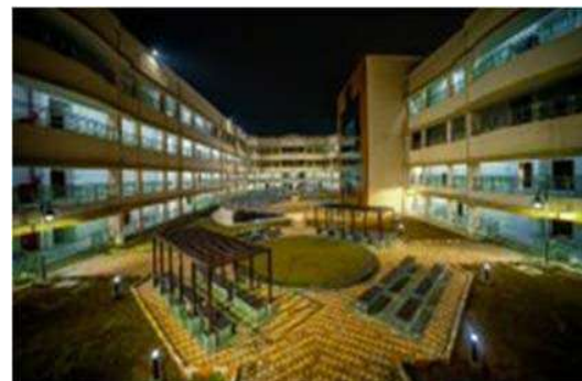
'Diamond Jubilee Lecture Hall Complex NIT Jamshedpur