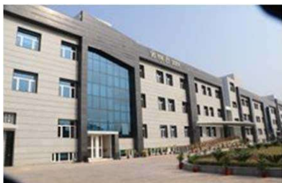
GST Bhawan, Panchkula