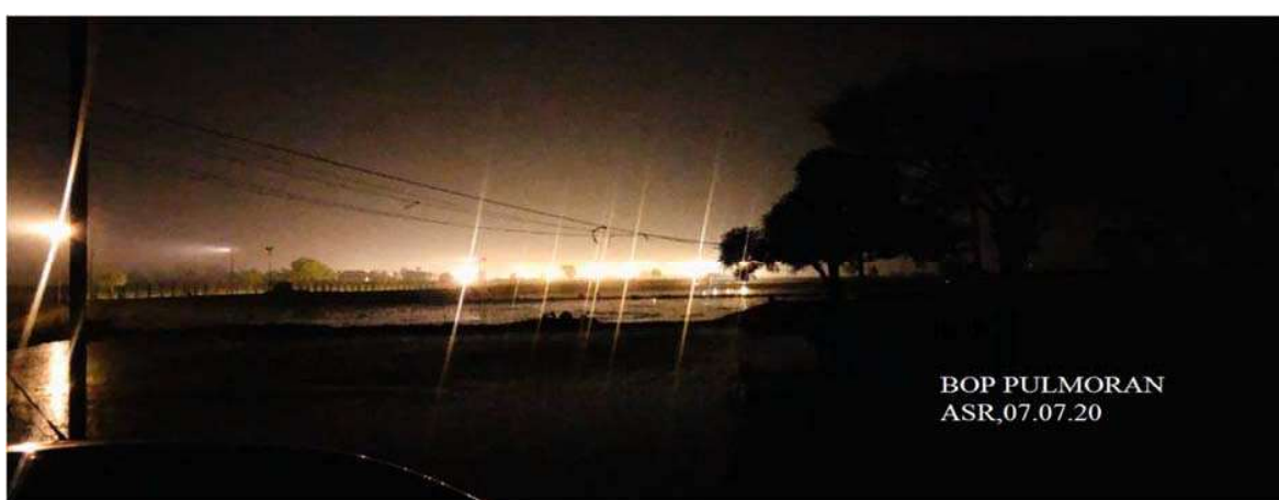
Replacement of Border Flood Lighting infrastructure along Indo-Pak Border under Punjab Frontier (in progress)