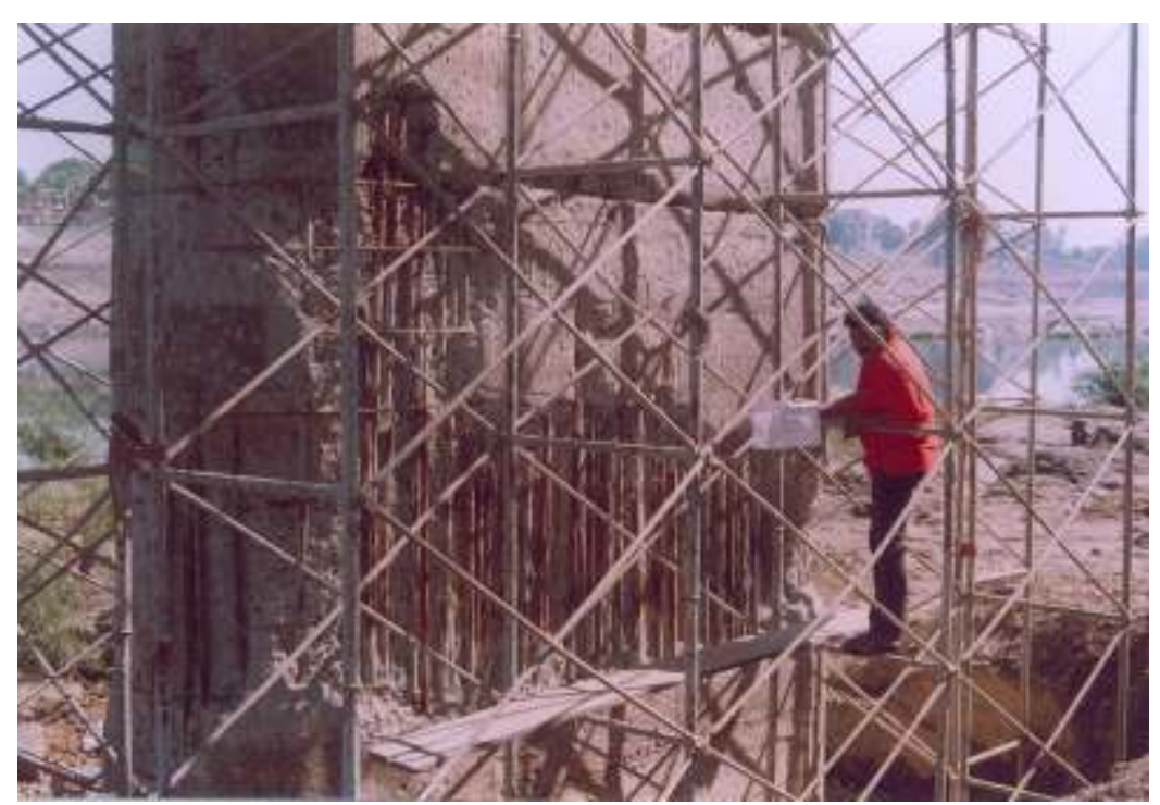
Repair of Athal bridge in progress

CPWD has developed expertise in repair and rehabilitation of structures in distress. The Daman & Diu Administration has entrusted repair work of some bridges which had been got built by them from some other agencies to CPWD. Work on this is in progress.