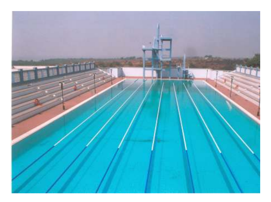
Two hockey fields with synthetic surfaces, as per international standards were completed by CPWD for Sports Authority of India in Bhopal in 2005 .

diving board at 1m & 2.15m and Diving Platform at 2.5m, 5m, 7,5m & 10m heights. In the tiers around the pool, a seating capacity of 500 has been provided. It has also a state of art filtration plant. A water cascade is also incorporated in the pool premises. The surrounding area has been amply landscaped. Overall cost of the project was Rs.3.43 crores.