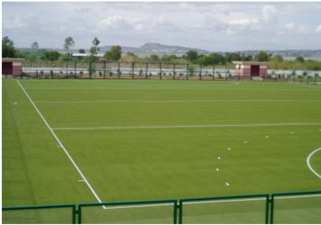
A detailed project report for modernization and up-gradation of sports facilities in different stadiums of the Sport Authority of India has been prepared and submitted to the Ministry of