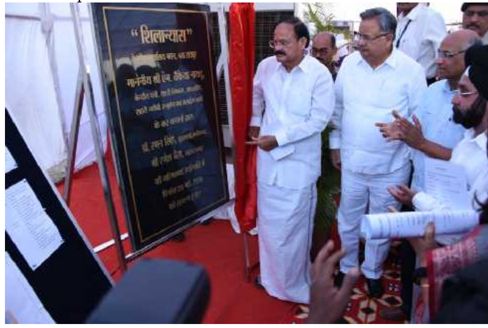
THE NEWSLETTER, MAY 2015 ISSUE