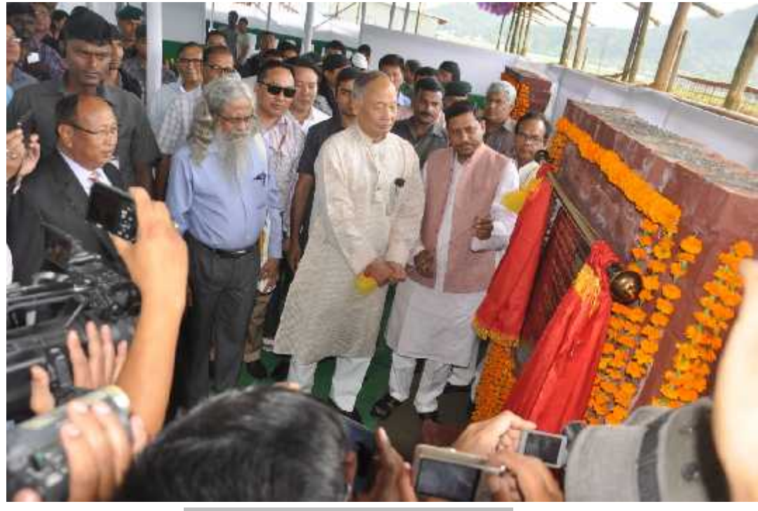
THE NEWSLETTER, MAY 2015 ISSUE