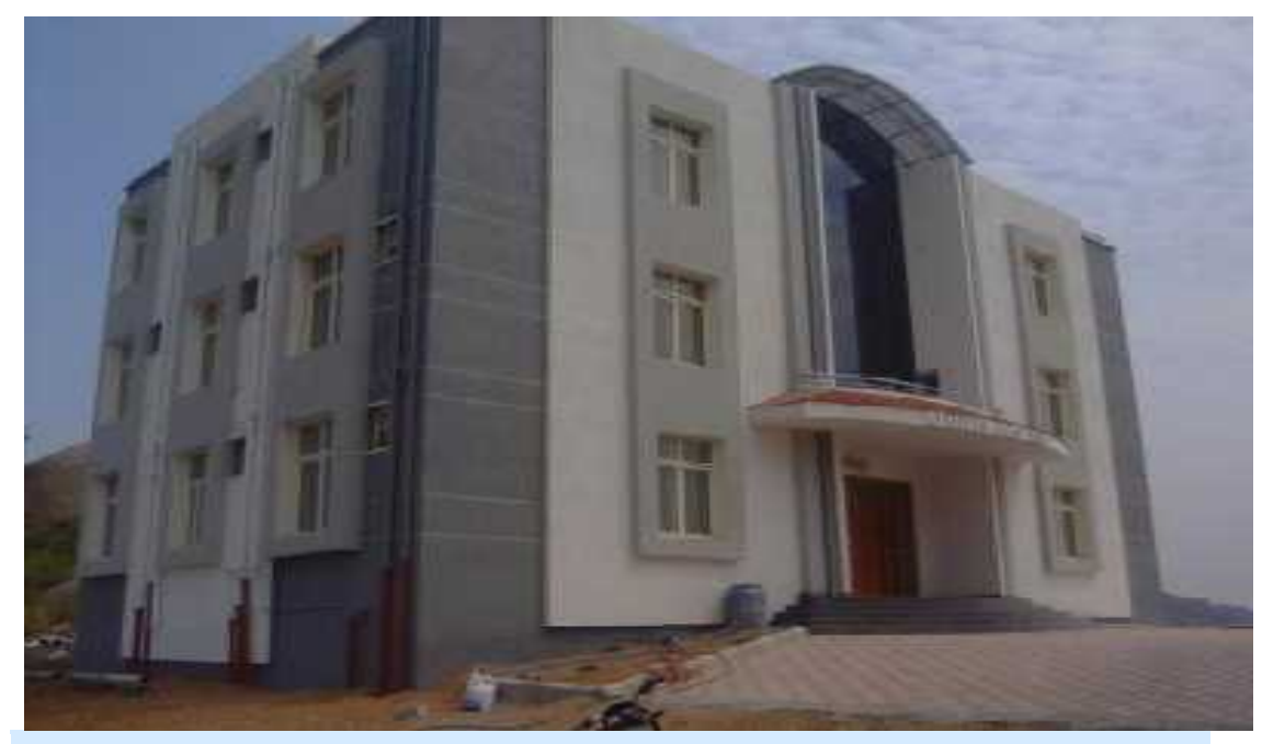
COMPLETED GUEST HOUSE BUILDING FOR SATAVAHANA UNIVERSITY AT KARIMNAGAR.

1. During the month, total 24 ongoing projects amounting to Rs. 38.23 crores completed.