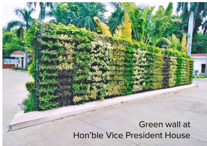
Green wall at Hon'ble Vice President House