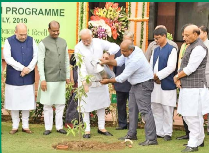
Hon'ble Prime Minister planting tree at Parliament House Complex