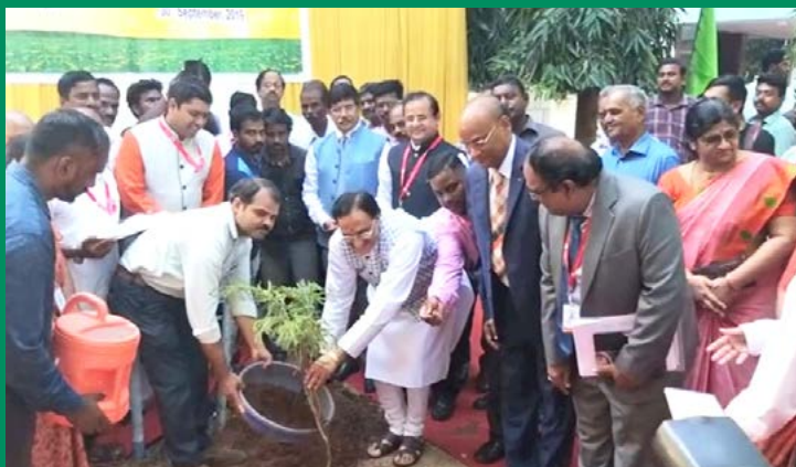
Tree Plantation by Hon'ble Union Cabinet Minister of Human Resource Development at Chennai during Hariyali Mahotsava 2019.