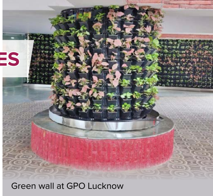
Green wall at GPO Lucknow