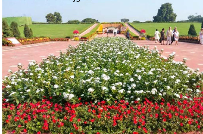
Celebrating 150 th Birth Anniversary of Mahatma Gandhi Ji at Rajghat