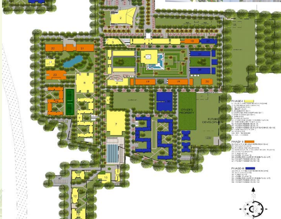
Layout Plan of proposed Campus