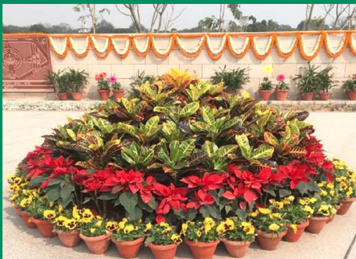
Floral Decoration at National War Memorial, India Gate