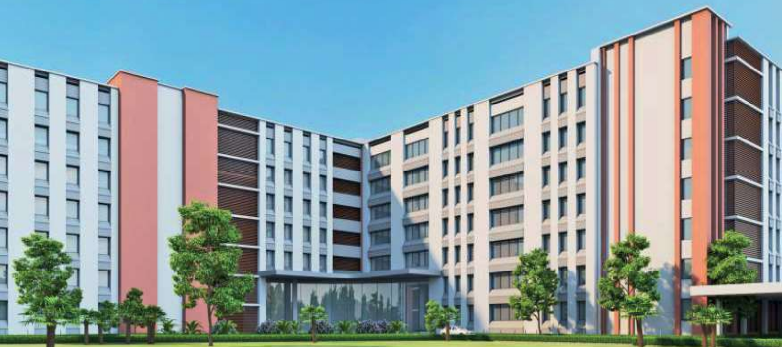
New Academic Complex - II at IIT Madras