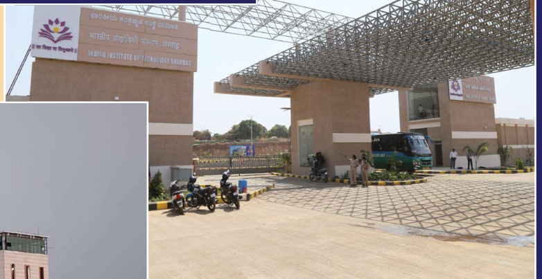
Main Gate Complex