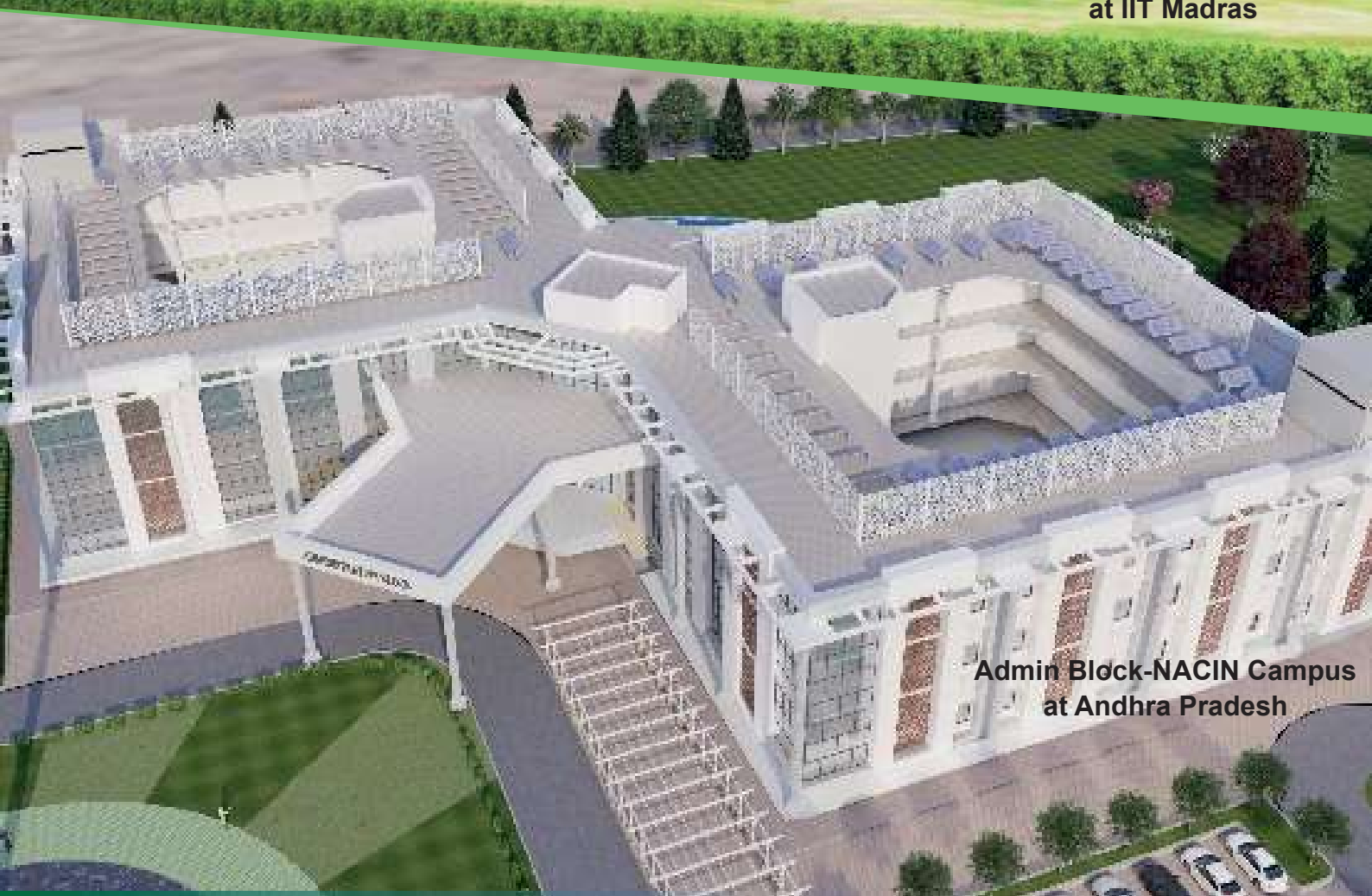
Admin Block-NACIN Campus at Andhra Pradesh

Please send your suggestions to: Technical & Public Relations unit Central Public Works Department