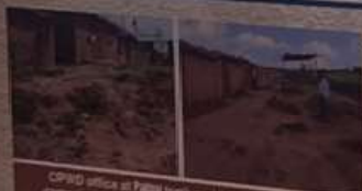
CPWD office at Patna took part in the cleanliness campaign in the Shramjeevi Camps as part of the initiative by CPWD to enhance city cleanliness and contribute to a Garbage Free India.

The achievements and activities on the Special Campaign by CPWD has been regularly publicised and tweeted/posted through its social media handles (Twitter(X), Facebook, Koo, Instagram and YouTube) and its official website to spread public awareness.