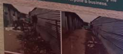
CPWD field office organized the Cleanliness drive at Shramjeevi's premises Tumakuru, with a special emphasis on timely cleanliness.