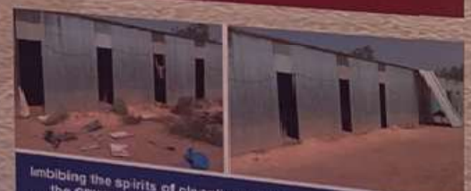
Imbibing the spirits of cleanliness among the Shramjeevis, the CPWD office in Sanjal conducted the cleanliness drive at its project site. Various indoor & outdoor cleanliness activities were carried out in the entire Shramjeevi camps.