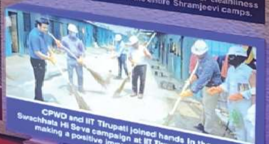
CPWD and IIT Tirupati joined hands in the Swachhata Hi Seva campaign at IIT Tirupati Campus site, making a positive impact on the environment.

CPWD, set up a stall, highlighting its accomplishments in Special Campaign 3.0 at the exhibition held on 19.12.2023 at Dr Ambedkar International Centre, New Delhi, as part of the Inaugural Function of Good Governance Week 2023 Celebrations .