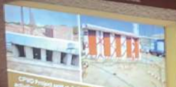
CPWD Project unit at Jaipur ensured that cleanliness activities were done with dedication. The drive spread the message of maintaining cleanliness in the district's towns and surroundings of their living areas.