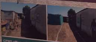
CPWD office at Jaipur conducted the Cleanliness drive in the entire Shramjeevi premises at the project site, disseminating the importance of timely cleanliness and reinforcing the concept of cleanliness as everyone's business.