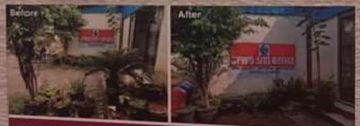
Officials at the CPWD site office of GPRB Raipur spread the awareness for Swachh Bharat by doing voluntary Shramdaan for the Swachhta Hi Seva campaign.