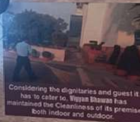
Considering the dignitaries and guest it has to cater to, Vijaya Bhawan has maintained the Cleanliness of its premise both indoor and outdoor.