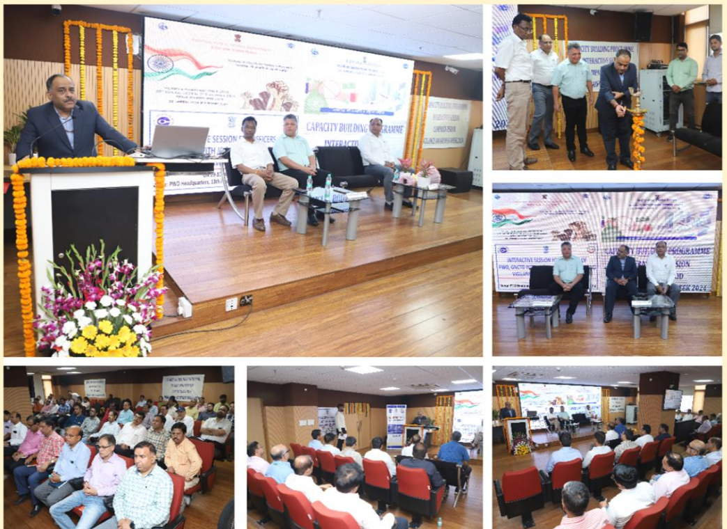
8 th Interactive Session on October 29, 2024 at New Delhi to make aware and sensitize PWD GNCTD Engineers / Field Officials