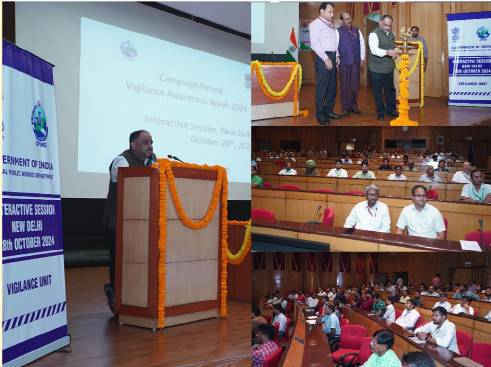
7 th Interactive Session on October 28, 2024 at New Delhi to make aware and sensitize CPWD Engineers / Field Officials

Vigilance unit organized Interactive Session to make aware and sensitize field officials to avoid lapses of repetitive nature at New Delhi. Shri Sanjeev Sehgal, JS and CVO, CPWD; Engineers and other officials participated in the session, wherein already concluded Vigilance cases were discussed to sensitize the officers/officials on these matters.