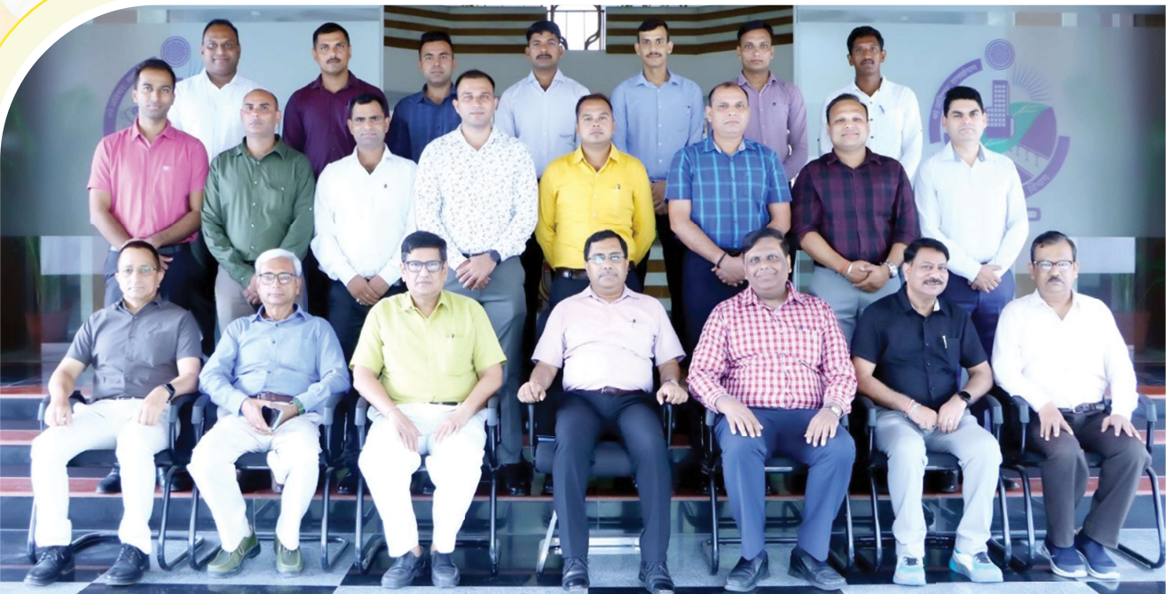
Four days training program for Engineering staff of NDRF from July 15 to 19, 2024 at National CPWD Academy, Ghaziabad