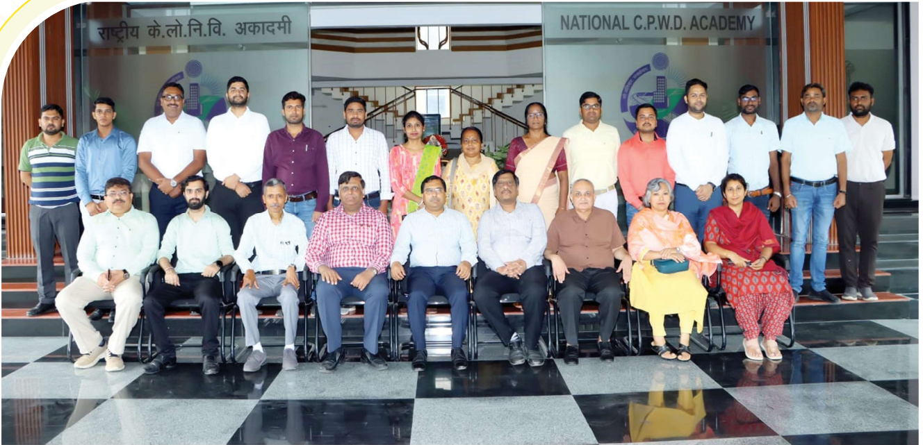
Course on Building Information Modeling with Integrated Services for CPWD Officers from July 22 to 26, 2024 at National CPWD Academy, Ghaziabad