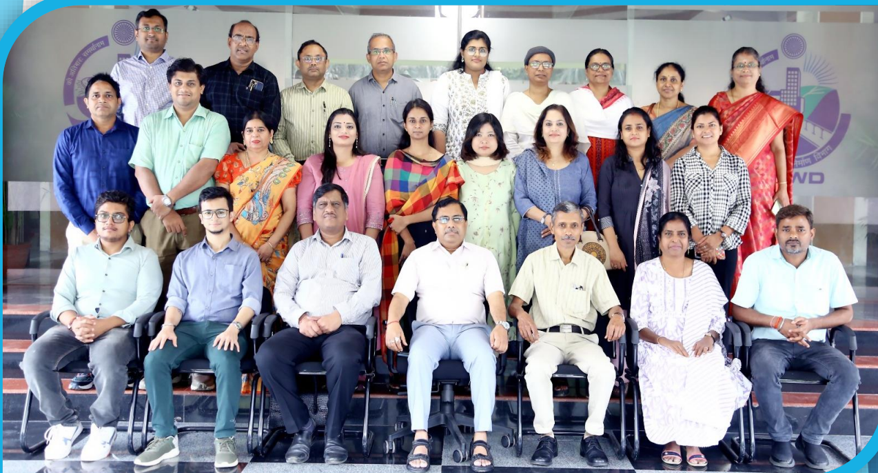
Course on Building Information Modeling with Integrated Services for CPWD Officers from September 02 to 06, 2024 at National CPWD Academy, Ghaziabad