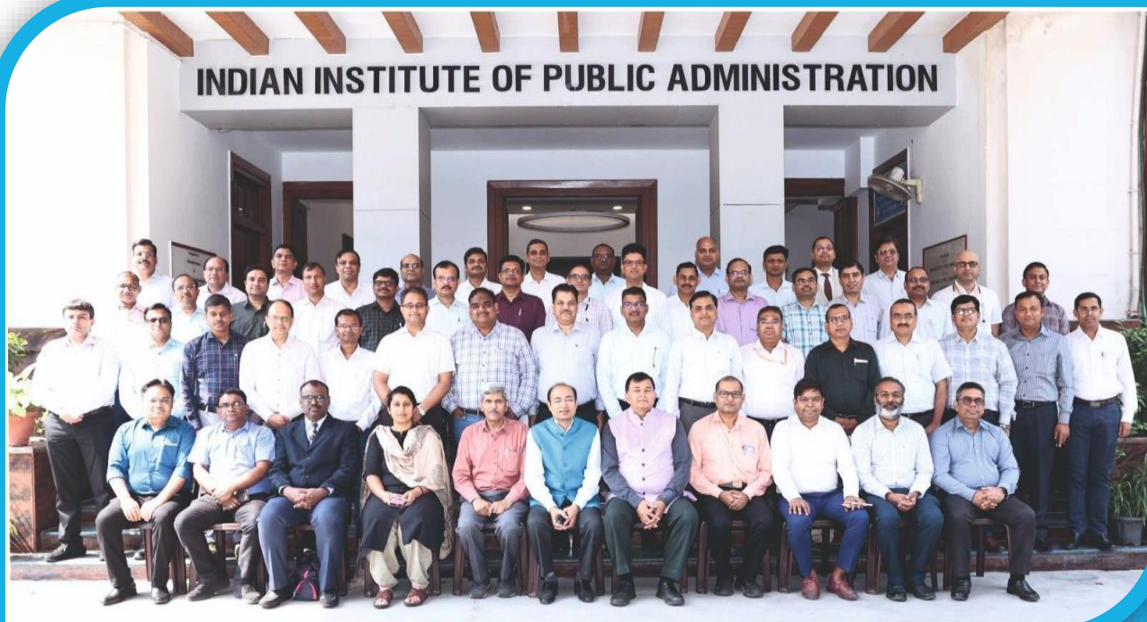
Mid-Career Training Programme (MCTP) on Higher Management for IES Group 'A' Officers, Superintending Engineers (Civil & E/M) of CPWD from October 14-15, 2024