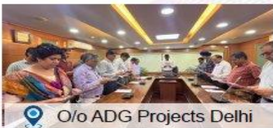
O/o ADG Projects Delhi