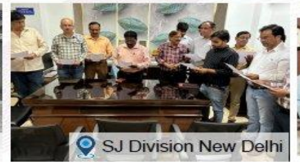
SJ Division New Delhi